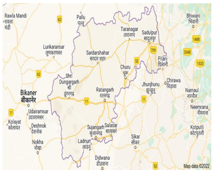
Fig. 1: A map of Rajasthan depicting the Churu study area

Bagad is spoken predominantly in Sardarshahar, Taranagar, Ratangarh, and Sadulpur. Communication is often done in Rajsthani and Marwadi among the people who live in Churu, Sujangarh, Chapar, and Bidasar.