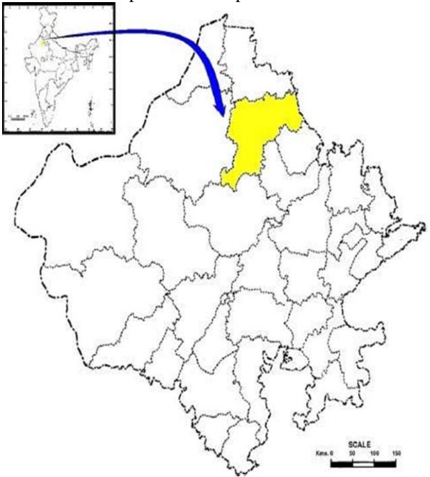
Fig 2: A Outline Rajasthan Map depicting the District Churu

Celsius in the winter to 49.8 degrees Celsius in the summer, shifting dunes, irregular and little rainfall, strong wind speeds, and sparse, prickly flora. The temperatures in the area range from -2 degrees Celsius in the winter to 49.8 degrees Celsius in the summer. The location has received much praise as a result of these characteristics. Temperatures in this part of the world range from a low of -2 degrees Celsius in the winter to a high of 49.8 degrees Celsius in the summer. The growth of desert flora that offers a range of medicinal advantages may be connected to the region's rich sandy soil and high sunlight levels, both of which are significant natural resources. The arid environment provides the perfect conditions for the growth of plants of this sort. Most individuals know the chemicals provided and their potential therapeutic usefulness.