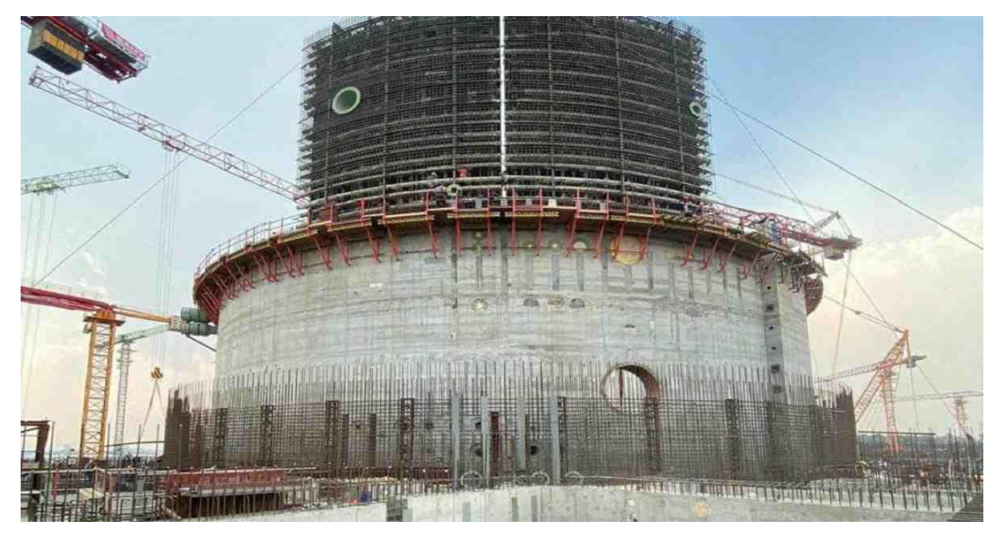
Figure: 2 . A 10 m high section of turbine building, RAPP-5&6 built with SCC

The self-compaction ascribes of SCC is achieved by appropriate work of superplasticiser, low water-to-powder (concrete + mineral admixture + any trimmings having particle size not more than 125µ) extent and usage of VMA. Plan of SCC mix is more convoluted than usually situated significant mixes (Skarendhal and Paterson 2000). Choudhury (2008) summarized the mix plan procedures open for SCC. This huge number of techniques put highlight on rheology; strength is managed by suggestion by primers. Chowdhury and Basu (2012a) cultivated one more arrangement framework for self-compacting significant mixes in with high volume fly trash. The method degrees a SCC mix with identical importance to achieve fitting rheology and decided target strength clearly with least starters. M25 to M40 level (BIS 2000) SCC with high volume fly garbage having CRL 40% and half were used in the improvement of a couple of significant plans of RAPP-5&6, Kaiga-3&4 and TAPP-3&4. Essential pieces of greater angle can be created in more restricted time with SCC, Fig.2. The overall Indian experience of SCC in NPP significant plans is enabling (Basu et al. 2007). SCC with high volume fly flotsam and jetsam has moreover been used in the new improvement of KAPP-3&4 and RAPP-7&8. Covering the usage of SCC in the improvement of NPP structures is incredibly limited.