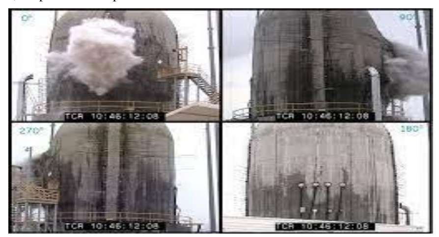
Figure: 3 The NUPEC/NRC PCCV model tested by Sandia National Laboratory

The features and size of the PCCV model were picked so the response of the model would mimic the overall approach to acting of the model and neighborhood nuances, particularly those around doors, would be tended to. Advancement started in 1997 and was done in 2000. Synchronous with the advancement of the model, Sandia acquainted just about 1500 transducers with screen the strain, movement, powers, temperatures and pressures in the model.