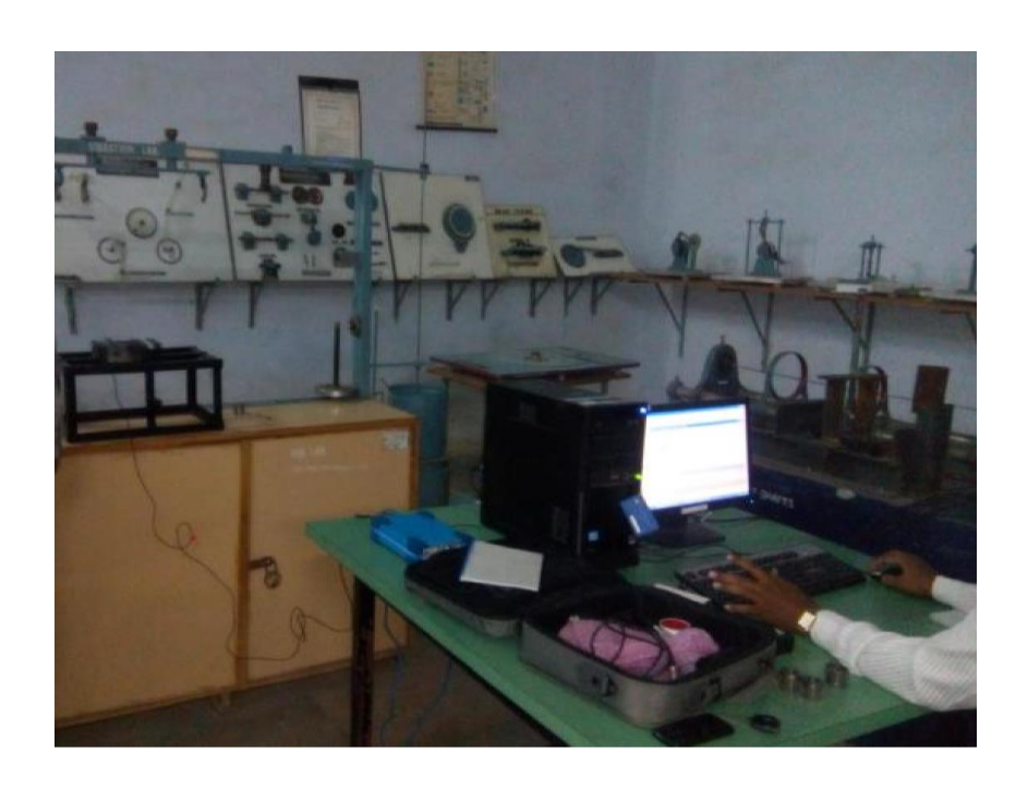
Figure.2 Actual Experimental setup of gear pair on FFT

close to practical values through simulation/ analyses. The technique would deployany of the following software tools: Patran/Nastran, ANSYS, Abaqus or any compatible CAE software in the Structural/NVHdomain.