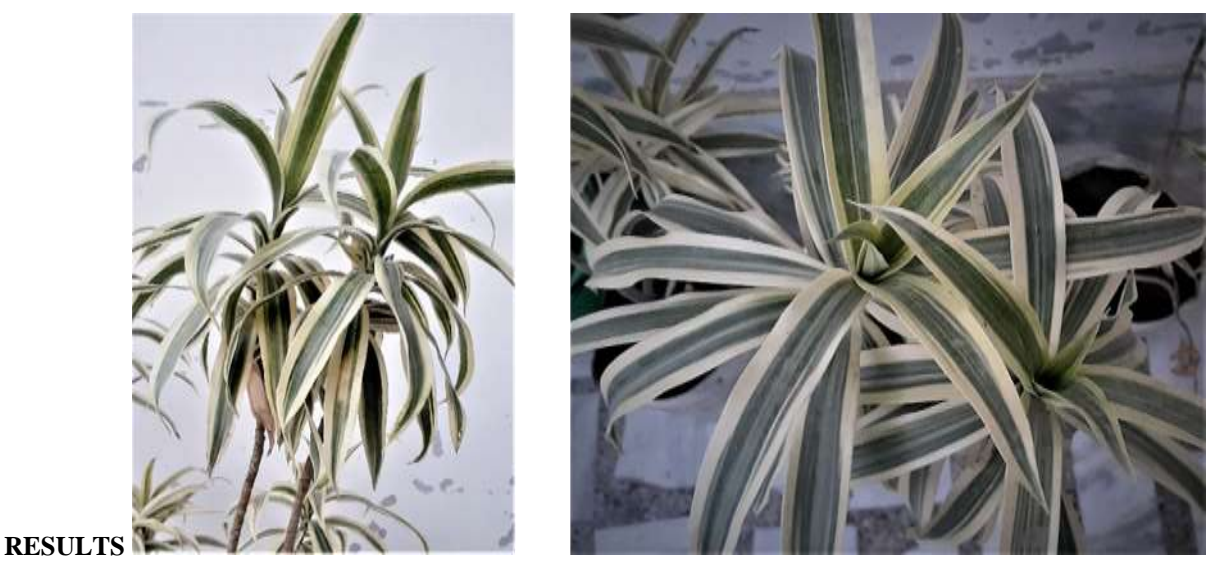
Figure 1: Dracaena reflexa plant

Three discs were prepared 1. The sample discs, 2. the standard antibiotic discs, and 3. the control discs were settled slowly on the before marked zones on the agar plates pre-infused with microorgenism. The agar plates were stored in a refrigerator at 4^{\circ} C for 24 h upside down to permit sufficient diffusion of the materials for the discs from the surrounding agar medium. The plates were then reversed and kept in an incubator at 37^{\circ} C for 24 h. The potency of antibacterial agents is measured by observed their activity to prevent the growth of the microbes around the Petri discs which revealed a clear zone of inhibition. After incubation, the antibacterial activities were measured the diameter of the zones of inhibition in mm by varnier caliper. The discs were placed in such a way that they should not closer than 15 mm for the lead of the plate and distant enough apart to prohibit overlapping the zones of inhibition.