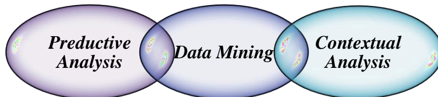
Figure 3: Different HR Analytic Techniques

“Human Resource Analytics” is also called “People Analytics” and it refers to the engagement of analytical techniques such as data mining techniques, predictive analytics, and contextual analysis in order to help managers and HR professionals within a business for making a better decision, which is associated with their workforce structure.