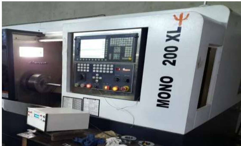
Figure 1: CNC Lathe