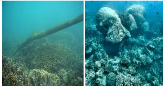
Fig. 3: RESTORATION RESULTS AFTER USING MSRCR