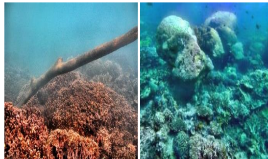
Fig. 5: RESTORATION RESULTS AFTER USING HYBRID MODEL (CLAHE AND DSIHE)