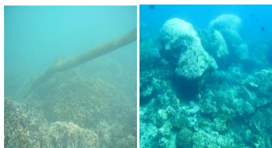
Fig. 2: INPUT RAW SAMPLE IMAGES

Use Python 3.6.4, OpenCV 3.4.6, scikit-learn 0.20, and matplotlib 3.1.1 to run the simulation. For the images of the actual situations, many underwater images from aquatic life image websites and national geographic databases were used. The suggested method's performance is compared to that of other approaches like MultiScale Retinex with Color Recovery (MSRCR) and Adaptive Histogram Equalization (AHE). The sensory quality of the two image samples was evaluated using existing algorithms such as AHE, MSRCR, and the proposed hybrid approach (CLAHE and DSIHE). The proposed method is optically superior to all existing methods, as shown in the following figure.