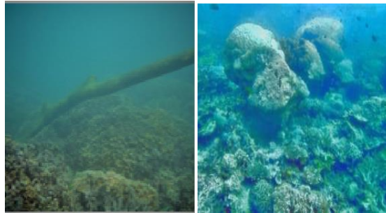
Fig. 4: RESTORATION RESULTS AFTER USING AHE