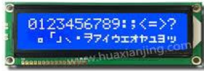
Fig 3:16x2 LCD display

Push Button: It functions as a simple switch that performs a function of cancellation. In case a customer scanned an item by mistake or doesn't need the product anymore then they can press this button and scan the unwanted product within a stipulated time so that it can be removed from the current bill.