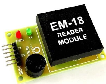
Fig 2: EM-18 RFID Reader Module

module (Em-18 in this case) when the tag comes in the vicinity of the Reader. This module has an inbuilt antenna that operates at a frequency of 125 kHz and a 5v DC power supply is required to power it up. It gives a serial data output and has a range of 8-12cm. The serial communication parameters are 8 data bits, 1 stop bit, and a 9600 Hz baud rate.