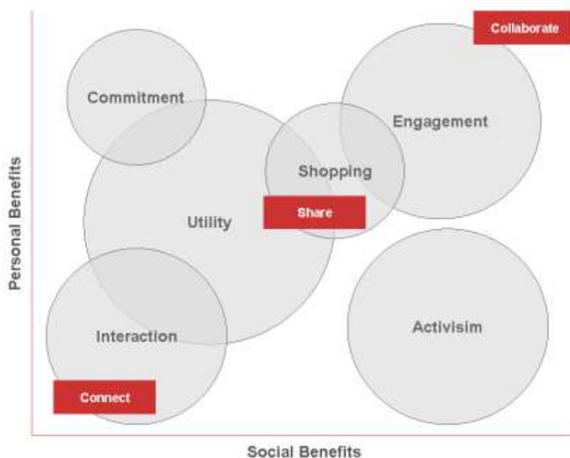
FIG 2.Promotion of Green Products using Social Networks

A growing number of modern consumers want to know whether companies treat their employees fairly and contribute to environmental preservation and conservation. For the first time in recent memory, consumers' shopping lists include brand ideals such as social responsibility, community benefit, and "going green." Technophiles, not unexpectedly, are in the vanguard. More than ever before, customers prioritise buying things that have high value. At a time when the economy is so unpredictable, customers want to spend their money with businesses they can trust to do the right thing, whether that means sticking to social distance standards or recycling their packaging. Despite the surprisingly positive environmental effect of social distance and lockdowns, consumers are still thinking green and acting accordingly. Brand advocacy has taken on additional importance in today's challenging climate, especially for small businesses. People are going above and above to aid them when they are in need, such as buying coupons to be used after the lockdown or giving their assistance on a crowdsourcing website for them to utilise once it is lifted.