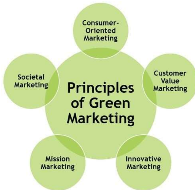
FIG 1. Basic Principle of Green Marketing

doing. Customers used to be unconcerned about the goods they purchased and drank, but those days are long gone. These days, customers are more environmentally concerned, and knowledge of the damage caused by manufacturing and consumption habits has shifted dramatically. Customers' purchasing habits have changed to include more organic and environmentally friendly options, as previously said. As for businesses, they've made a giant step ahead by focusing on environmental issues throughout product development, manufacturing, and disposal or recycling thereafter.