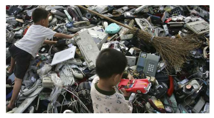
FIGURE 3 LIVING WITH ELECTRICAL WASTE AND HARMFUL RISKS TO PEOPLE'S HEALTH

In this situation, many countries around the world now require electronic companies to be responsible for recycling their products. Japan, South Korea and most European countries now force manufacturers to pay and manage product recycling programs. However, computer garbage is one thing. Activists are now concerned about TVs, items that have caused an increase in the amount of electronic waste in the world over the years. Because more and more people use flat-screen TVs and they mercilessly discard outdated machines [7].