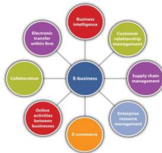
FIGURE 1: E-BUSINESS CYCLE

Numerous multiple times we utilize the term web-based business and e-business conversely, yet unmistakably they are particular ideas. In web-based business, data and correspondences innovation (ICT) is utilized in between business or between hierarchical (exchanges between and among firms associations) and in business-to-customer (exchanges between firms/associations and people).