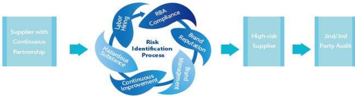
FIGURE 2: E-BUSINESS (B2C)