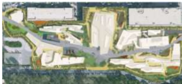
Figure (6) The green and open areas inside the campus

https://www.google.com/maps/@48.200801,16.4068106,1445a,35y,39.08t/data=!3m1!1e3