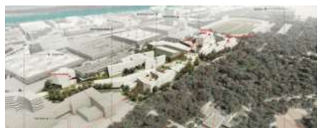
Figure (4) The boundaries of the UW within the city of Vienna / https://www.google.com/maps/@48.200801,16.4068106,14.45a,35y.39.08t/data=!3m1!1e3

Level 1: The level of campus engagement with the city is binary (university-city): The campus is an integral part of the city, a compact structure with it, an interactive educational landscape that combines the students' university life with the open space of the community. The university's administrators believe that the fences or barriers are incompatible with their vision of the University of the Future, as they put it. The removal of traditional boundaries has created a genuine urban link between the university and the city and a new public space in the city for social, cultural, and political life that meets the different needs of society. The Campus WU is an open and accessible space for the public that promotes this openness towards the city and a sense of security and social communication. In order to enhance this