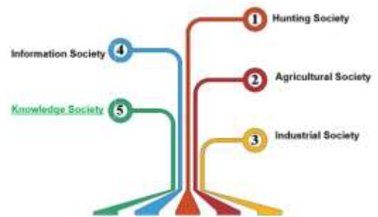
Figure (1) The stages of development of human societies / researcher

1.3 Knowledge Society Characteristics: The characteristics of the knowledge society were mentioned (6) in the following manner: