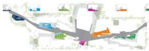
Figure (5) The path connecting the buildings and continuing between the gates to the outside

communication, the university is linked to a clear path with the city, which cuts through the campus, extending between gates, to form a multi-use path that is expanded once to form a square and stopping areas and is lost once to appear as walkers. The buildings are distributed on both sides to provide the user with recreational, cultural, and other services. shows the trajectory. The top priority in planning the campus in this integrated way with the city was to provide an environment for WU students, staff and members of the community as a whole to help them work productively.(33) Figure (4) (5)