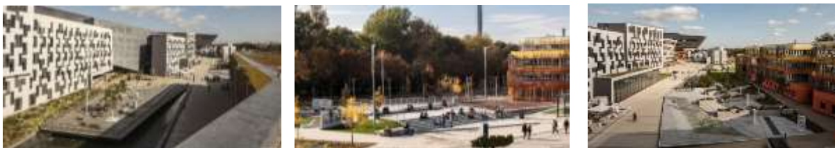
Figure (7) The outer spaces Pictures of the University of Vienna / Vienna University wu

As for the buildings, the university campus consists of six buildings, which include formal buildings such as educational and administrative buildings, in addition to informal buildings that are used by the city community as a whole, such as libraries, a learning centre, stores, bakeries, sports centres, restaurants, and a kindergarten. These buildings interact with each other through the ground floors that achieve communication. The entrances to the buildings, corridors, and views were designed to complement each other. These buildings are surrounded by walkways and environmentally protected areas serviced by technology that helps walk, share, and achieve chance encounters. In addition to the functional link, the university is linked visually with the surroundings, as some of its buildings were clad with material-mono with multiple degrees of transparency and particular angles of inclination to reflect the sky and the green areas that surround it, to generate a merger of buildings with the environment. As for the upper floors, they reflect views of the Vienna Center and the Parter Park.(35) Figure (7)