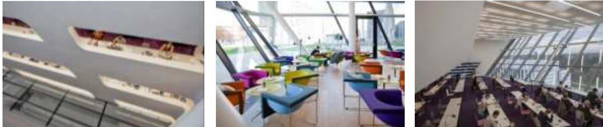
Figure (8) the interior spaces of the learning center building / Colorful furnishing by STUA brights up Zaha Hadid’s Vienna University Of Economics And Business | Inspirationist

library in Austria. It is also one of the largest in the German-speaking region. The brightly coloured sections house the service units, where individuals find all the knowledge-based service centres here under one roof to be used by both the university and city communities. Additionally, the LC Building on the ground floor houses the WU Café and Halls that host public events such as panel discussions and public lectures in these halls, bringing together international business and economic experts to attend conferences and meetings. The LC Forum offers an ideal venue for large-scale events such as student celebrations and small exhibitions. All halls are equipped with global learning techniques to accommodate more than 500 people, and all halls are equipped with natural lighting and the latest technological equipment. Students can access the cafeteria and self-study areas through the atrium to work quietly, arranged in a spiral shape around it. Project rooms encourage communication and teamwork, and a mixture of quiet spaces and open spaces linked through slopes and ladders provides a dynamic, comfortable atmosphere for the occupants(36) Figure (8)