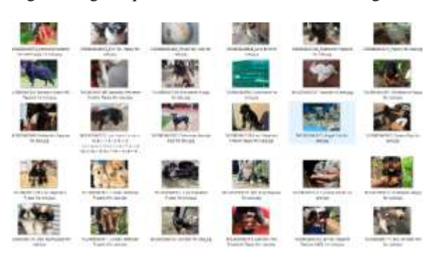
Fig 4- Kaggle Image Search API animal images