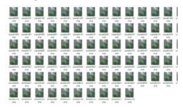
Fig 3- Image sequence for real-time animal recognition.

harm to the fauna. As a result, this project keeps track of the animals, and if any are discovered, the owner/farm keeper is notified via an alert. The owner will be able to simply find out where the animal is thanks to this technology. Farmers will benefit from this project since it will help them secure their crops and orchards, avoiding them from suffering economic damage and conserving them time and effort in the process. This will also assist them in generating higher crop yields, which will improve their financial situation.