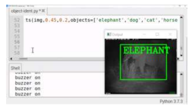
Fig 8- Identification of Elephant at night.