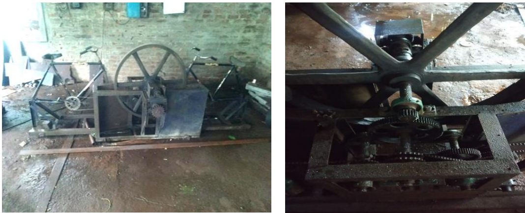
Fig 2: Experimental Setup-HPFM Tandem Drive

In the entire work done so far only one peddler is tried. As the system is introducing a new employment guarantee scheme with energy application or new process unit, it is worthwhile trying more than one peddler either two (i.e. tandem drive) schematically as shown in Fig.1 or three or even four. This innovation of the Energy unit may store more than 3000-4000 kgf-m energy in the flywheel [ 1,2,3,4,6,12,16 to 25,26 to 40].