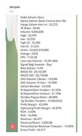
Figure 6. Analysis of the DSS model

The DSS model analysis result file is a stock recommendation that investors can choose to determine the buying and selling price based on the DSS model. As an illustration, see the Appendix, which presents some of the results of share recommendations by the DSS Model. To get a fundamental analysis of the DSS model, you can type AALI, and it will be displayed as shown in the following figure 6: